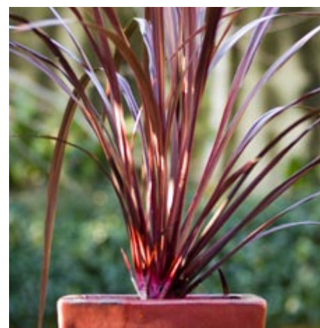
Anthony Tesselaar's Cordyline Red Fountain. A new plant variety may contain a number of intellectual property rights including a patent, plant breeder's rights and/or a trade mark.