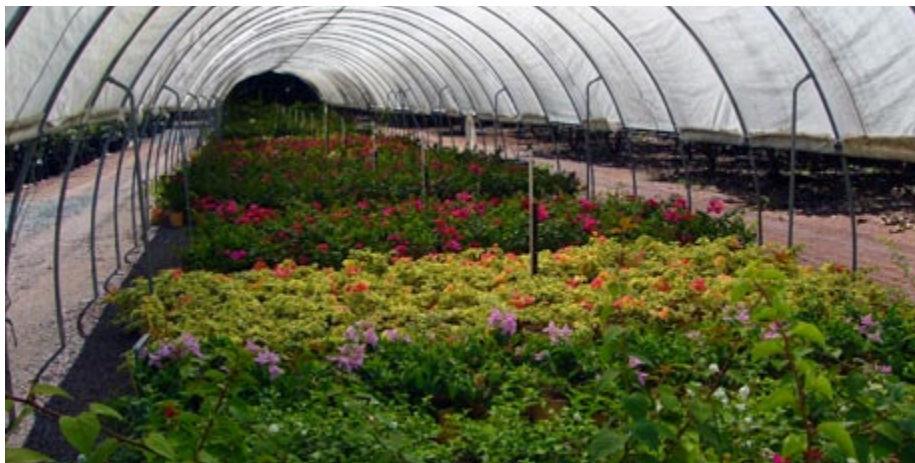
The nursery and garden industry has the highest percentage of protected plant varieties both in Australia and overseas.

The nursery and garden industry has the highest percentage of protected plant varieties both in Australia and overseas. As a consequence, there are benefits to understanding (at least some) intellectual property principles. Understanding intellectual property principles may be one way to maximise your commercial advantage. You could also be disadvantaged if you are uninformed, particularly if you do not understand your rights and obligations under plant breeder's rights, patents and/or your contracts. Additionally, the use of plant varieties in nursery and garden businesses is increasingly being controlled by contracts - often referred to as 'Agreements' or 'Licences'. It is therefore vital that you are familiar with the terms of any contract, especially as the contract relates to intellectual property, access to property and auditing requirements. Importantly, you don't even have had to sign a contract to be bound by its terms.