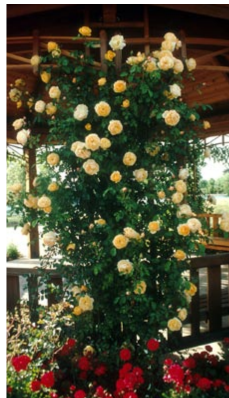
David Austin's Graham Thomas™ - a protected plant variety, this plant is also trademarked in some countries by David Austin Roses Ltd.

Businesses in the nursery and garden industry and their clients must be aware of their rights, duties and obligations. What are the restrictions on using a protected variety? Can you save (and use) propagating material? Does the licensor have the right to enter your property? Are you paying an upfront royalty or an end-point royalty? If so, how much is the royalty and when is it paid? These are the kinds of questions that all industry operators should consider.